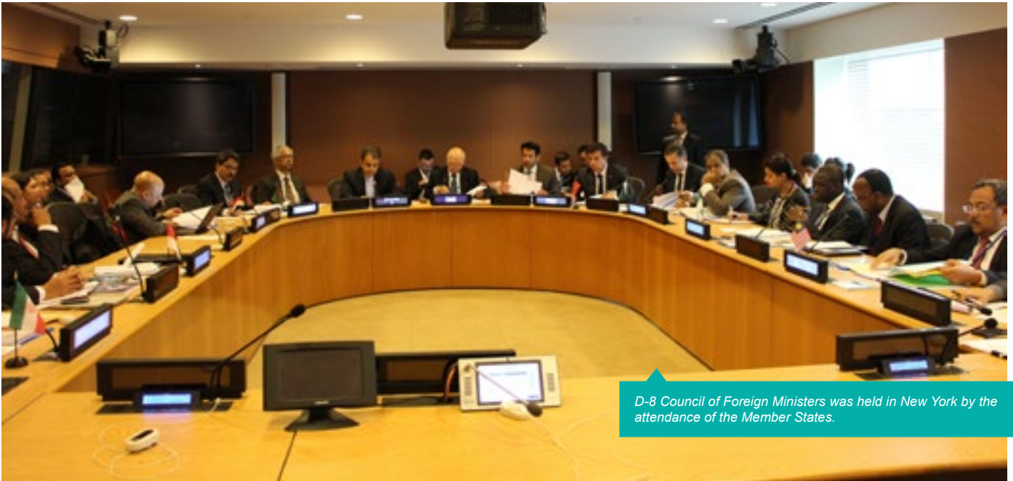
D-8 Council of Foreign Ministers was held in New York by the attendance of the Member States.