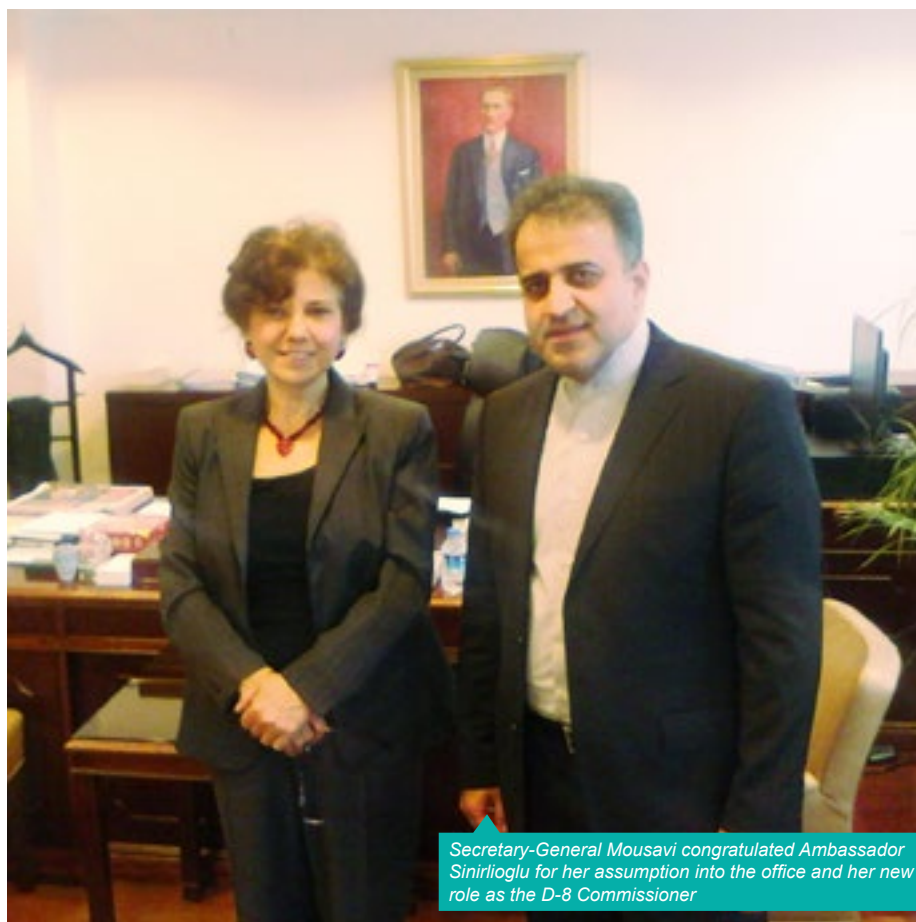
Secretary-General Mousavi congratulated Ambassador Sinirlioglu for her assumption into the office and her new role as the D-8 Commissioner

D-8 Observer status in the United Nations General Assembly which would add to the image of the Organization. They also emphasized more actions to improve visibility and image of the Organization. Secretary-General invited the Commissioner of Turkey to take part at the special session of the Commission