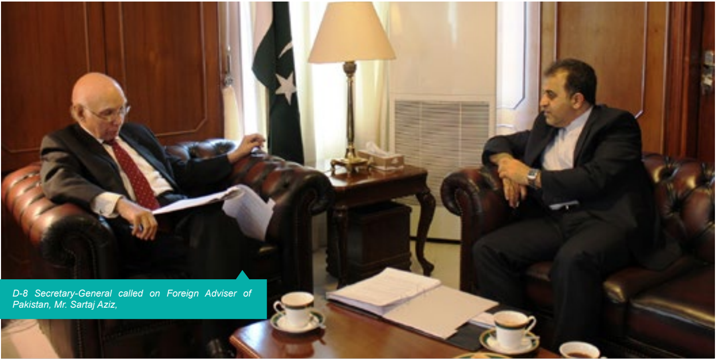
D-8 Secretary-General called on Foreign Adviser of Pakistan, Mr. Sartaj Aziz.