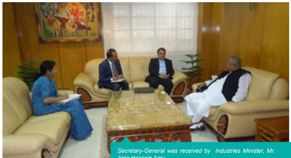
Secretary-General was received by Industries Minister, Mr. Amir Hossain Amu

Then Ministers thanked the Secretary-General for the update and assured him of all cooperation. They informed that Bangladesh as the founding member of the Organization remained committed and active in furthering the vision and objectives of the Organization in order to contribute to the uplift of life and living standards of the peoples of the region.