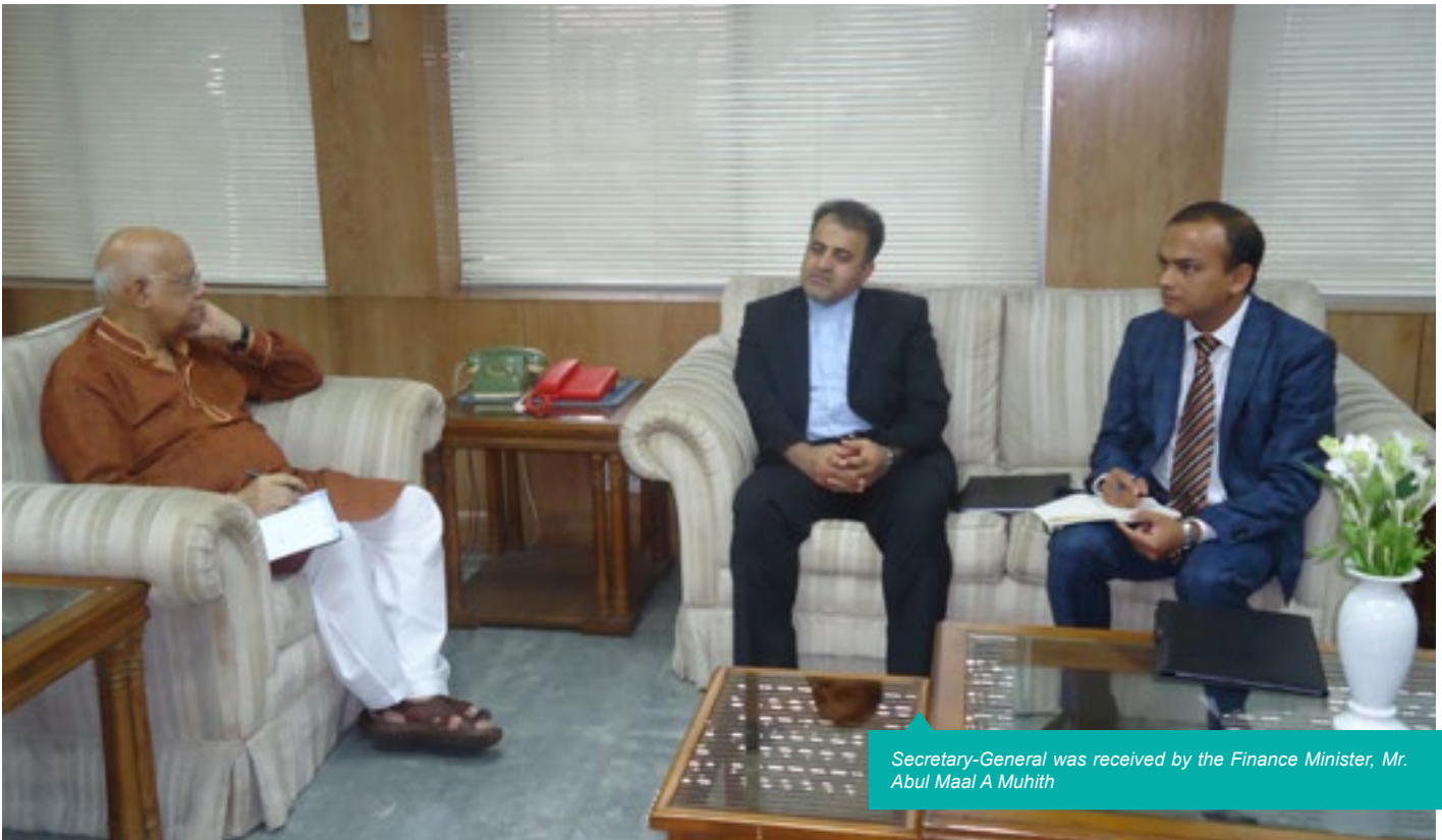
Secretary-General was received by the Finance Minister, Mr. Abul Maal A Muhith