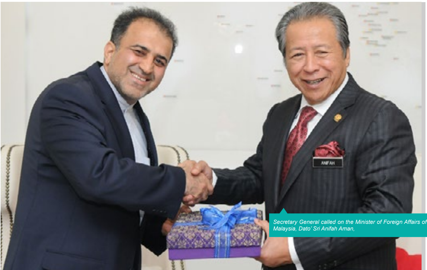
Secretary General called on the Minister of Foreign Affairs of Malaysia, Dato' Sri Anifah Aman,