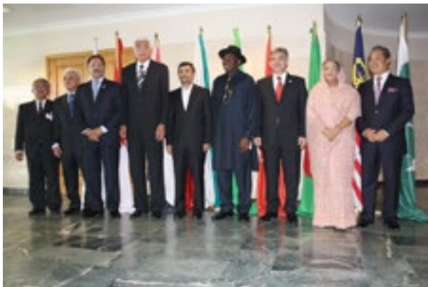
Seventh Summit (8 July 2010, Abuja, Nigeria)