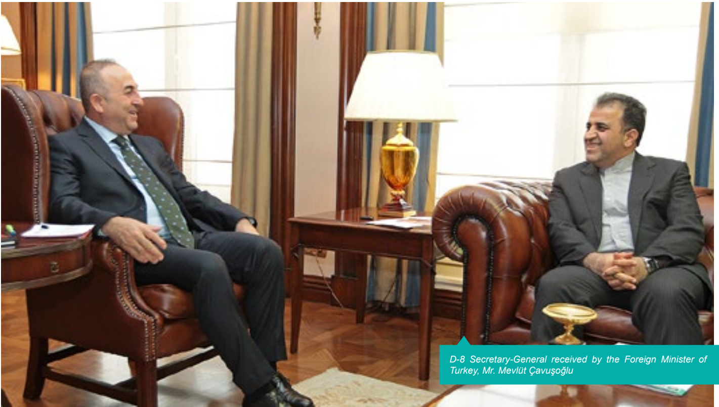
D-8 Secretary-General received by the Foreign Minister of Turkey, Mr. Mevlüt Çavuşoğlu