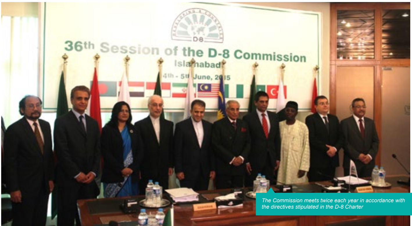
The Commission meets twice each year in accordance with the directives stipulated in the D-8 Charter

3 6 th regular session of the D-8 Commission was held in Islamabad, Pakistan from 4-5 June 2015 with the Chairmanship of Pakistan. Commissioners and Heads of delegation from all the D-8 Member States took part in the 2-day session. Mr. Syed Tariq Fatemi, Special Assistant to the Prime Minister on Foreign Affairs inaugurated the meeting and made opening statement.