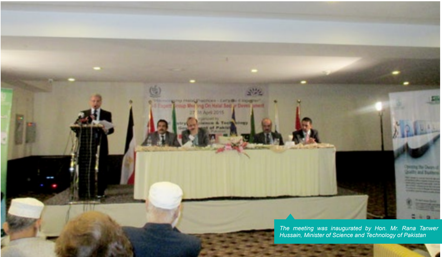
The meeting was inaugurated by Hon. Mr. Rana Tanwer Hussain, Minister of Science and Technology of Pakistan