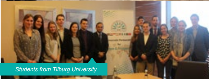
Students from Tilburg University