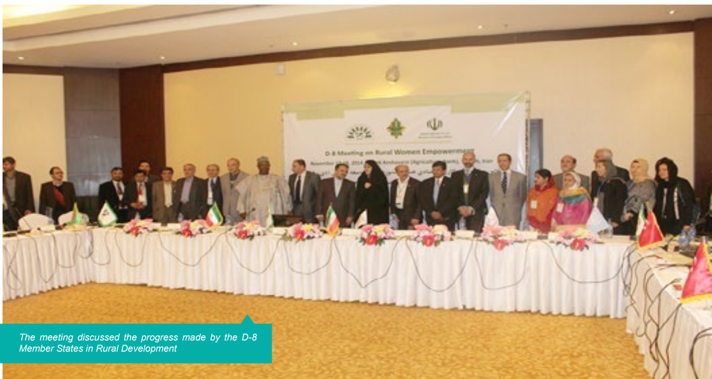
The meeting discussed the progress made by the D-8 Member States in Rural Development

T he D-8 Meeting on Rural Women Empowerment was inaugurated with participation from Bangladesh, Egypt, Indonesia, Malaysia, Pakistan and Turkey and some international organizations namely, APRACA, UNDP, UNICO, ECO, UNID and FAO on 17 November 2014 in Tehran, Iran.