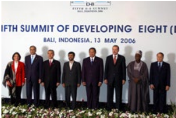
Fifth Summit (13 May 2006, Bali, Indonesia)