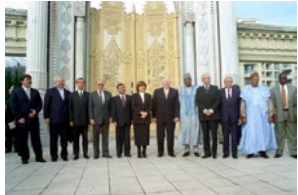
The late Prime Minister Necmettin Erbakan of Turkey and the D-8 Foreign Ministers at the first Council meeting ( 4 January 1997, Istanbul, Turkey)