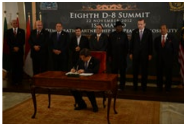
Adoption of the D-8 Charter is considered an important achievement for the Islamabad Summit