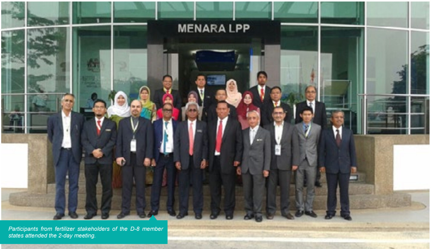
Participants from fertilizer stakeholders of the D-8 member states attended the 2-day meeting.

M alaysia hosted 3rd Ad Hoc Meeting to Consider the Formation of D-8 Fertilizer Association (D8FA) on 9-10 October 2014 in Kuala Lumpur. Participants from Bangladesh, Iran and Malaysia fertilizer stakeholders of the D-8 member states attended the 2-day meeting. For many developing countries in the world, including D-8 as one of economic grouping, fertilizer availability and affordability are critical to increasing agriculture production.