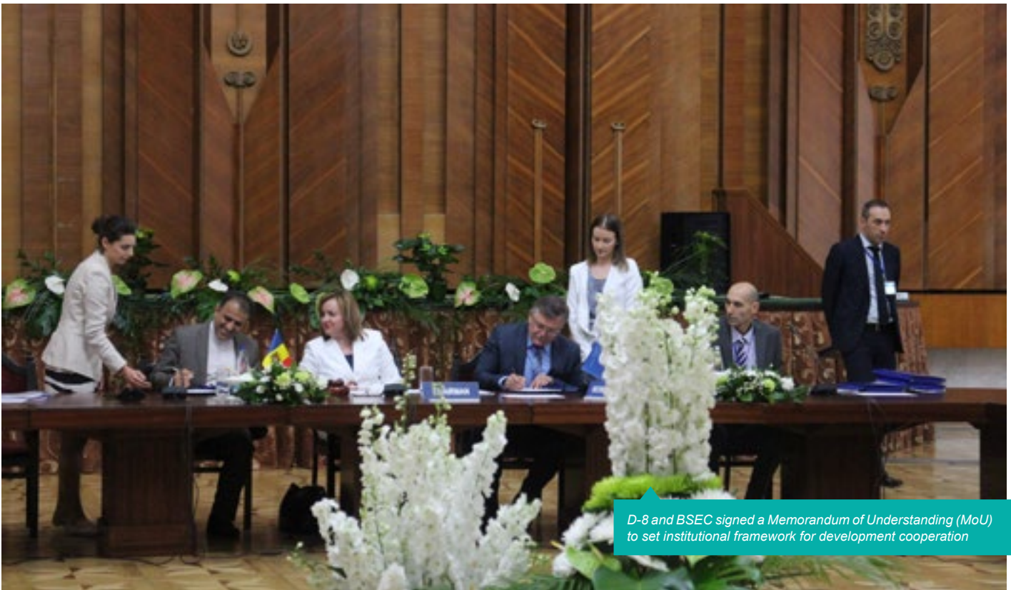
D-8 and BSEC signed a Memorandum of Understanding (MoU) to set institutional framework for development cooperation