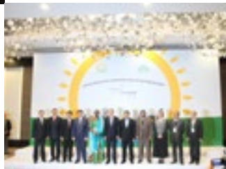
5 th D-8 Agricultural Ministerial Meeting held in Istanbul