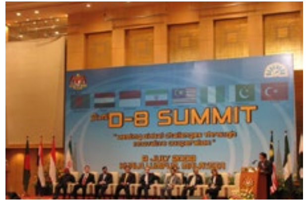
Sixth Summit (8 July 2008, Kuala Lumpur, Malaysia)