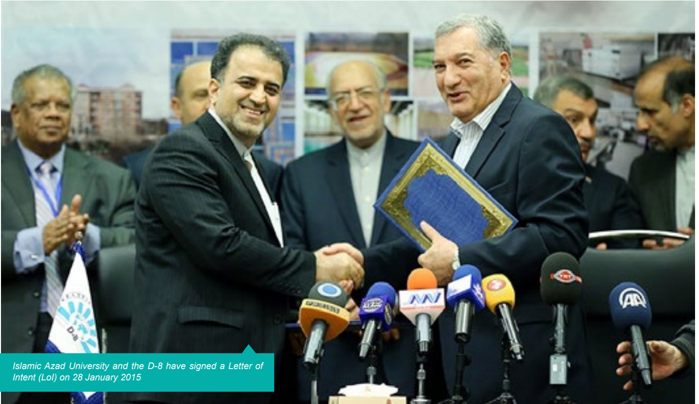
Islamic Azad University and the D-8 have signed a Letter of Intent (LoI) on 28 January 2015

In order to establish the D-8 University in Iran with a view to increasing economic and scientific cooperation among the D-8 Member States, Islamic Azad University and the D-8 have signed a Letter of Intent (LoI) on 28 January 2015 on the occasion of the 4th D-8 Ministerial Meeting on Industry.