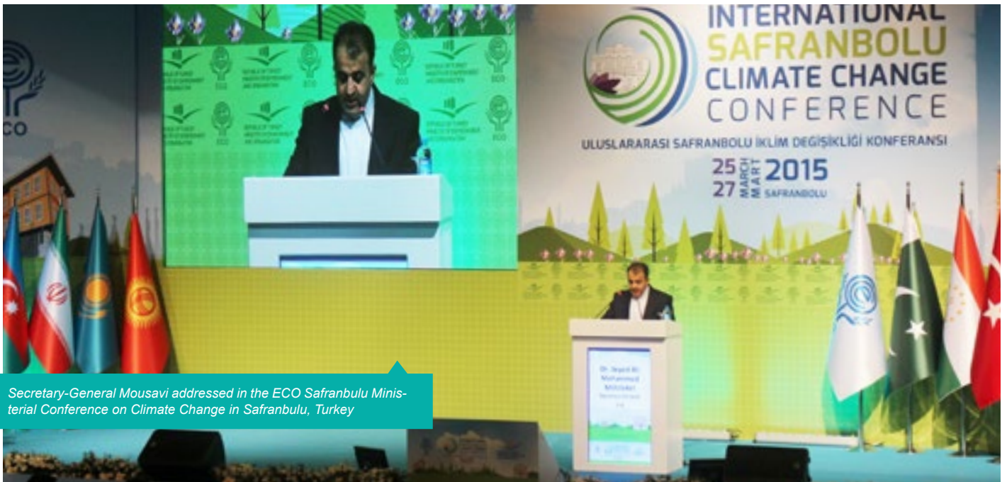
Secretary-General Mousavi addressed in the ECO Safranbulu Ministerial Conference on Climate Change in Safranbulu, Turkey

D r. Seyed Ali Mohammad Mousavi, Secretary-General of D-8, said that climate change would have direct impact on the ability of nations, developing world in particular. He called upon greater action for a strong climate change agreement which would encompass all externalities, enhance capacities of nations to handle changed circumstances and above all, create enabling environment for the ones struggling hard to survive. He underscored the need for a development approach which is sustainable in order to make people ready for anticipated change.