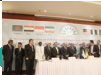
5 th D-8 Agricultural Ministerial Meeting held in Istanbul