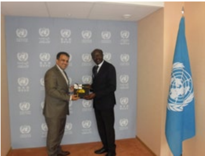
D-8 and UNCTAD had a lot of scope for joint effort in order to yield mutual benefit, sharing of information and analytical framework