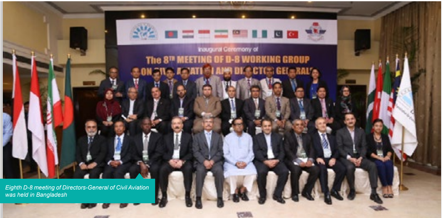
Eighth D-8 meeting of Directors-General of Civil Aviation was held in Bangladesh

B angladesh hosted eighth D-8 meeting of Directors-General and Expert Working Group on Civil Aviation from 24-25 August 2014 in Dhaka. Attendance by the Heads of Civil Aviation and high-level participation from the D-8 member states made the event more successful and result-oriented. Transportation, civil aviation in particular, is one of the priority sectors identified in the D-8 Roadmap for the economic uplift of the peoples of the region.