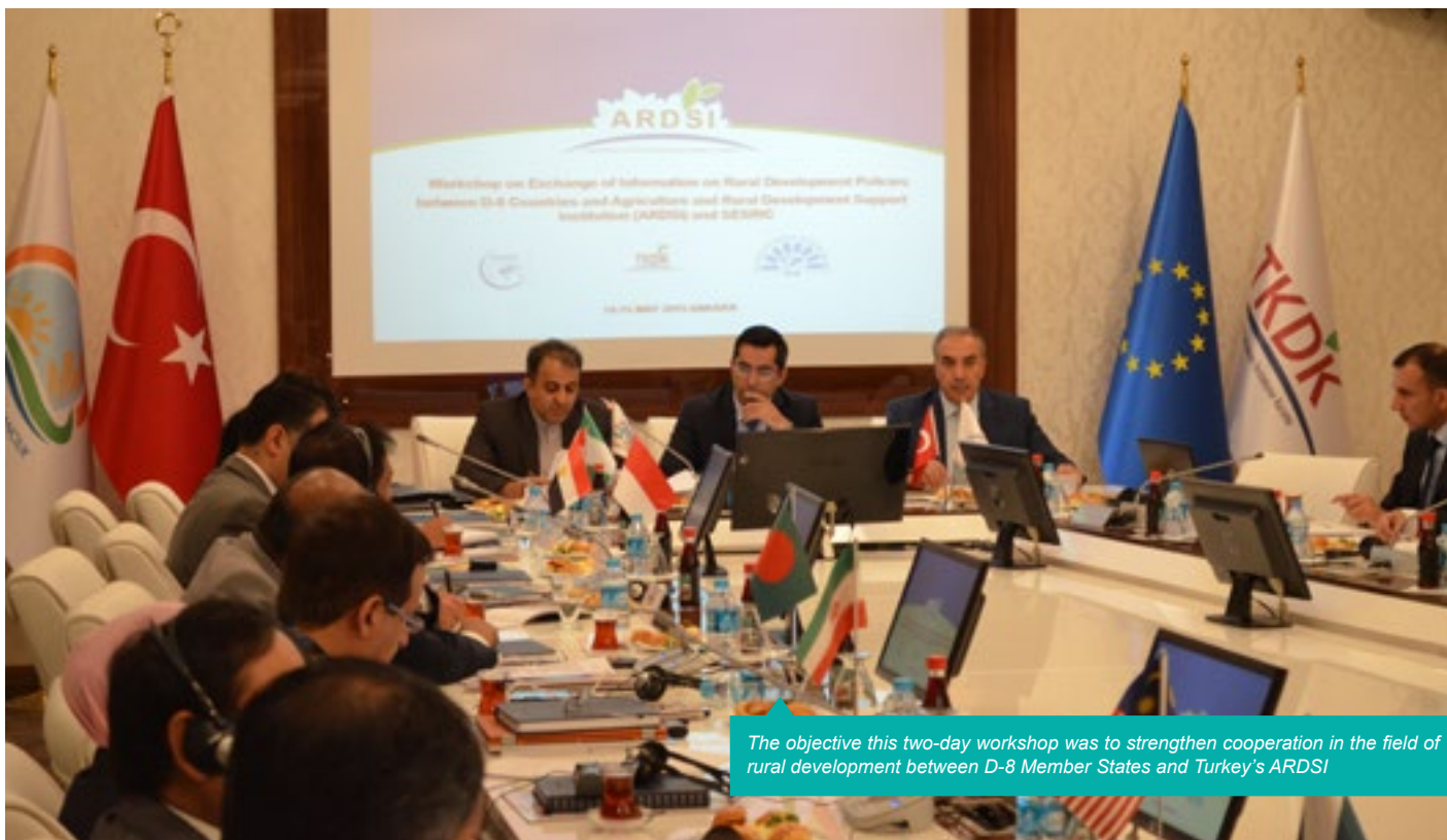
The objective this two-day workshop was to strengthen cooperation in the field of rural development between D-8 Member States and Turkey's ARDSI

It is expected that the workshop would earmark a crucial point in leveraging the rural-urban nexus for development, promoting an empowerment agenda for rural livelihoods, investing in smallholder family agriculture for global food security and nutrition as well as promoting the resilience of poor rural households.