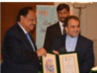
D-8 Secretary-General received 'Strategy' Award from the President of Pakistan