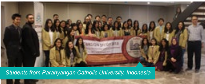
Students from Parahyangan Catholic University, Indonesia