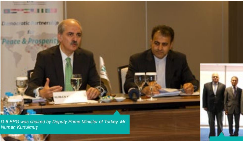
D-8 EPG was chaired by Deputy Prime Minister of Turkey, Mr. Numan Kurtulmuş