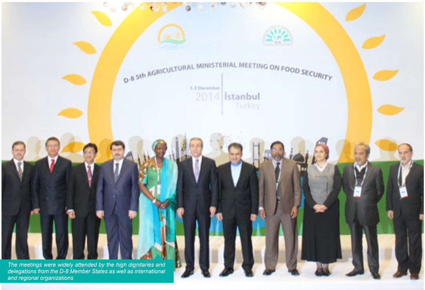
The meetings were widely attended by the high dignitaries and delegations from the D-8 Member States as well as international and regional organizations

T he 5th D-8 Agriculture Ministers' meeting was held on Wednesday, 03 December 2014, at Le Meridian in Istanbul, Turkey. The meeting was preceded by 5 (five) Working Group meetings on different sub-sectors in agricultural cooperation and Senior Officials' Meeting on Agriculture. The meetings were widely attended by the high dignitaries and delegations from the D-8 Member States as well as international and regional organizations.