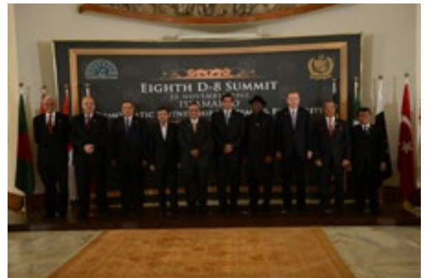
Eighth Summit (22 November 2012, Islamabad, Pakistan)