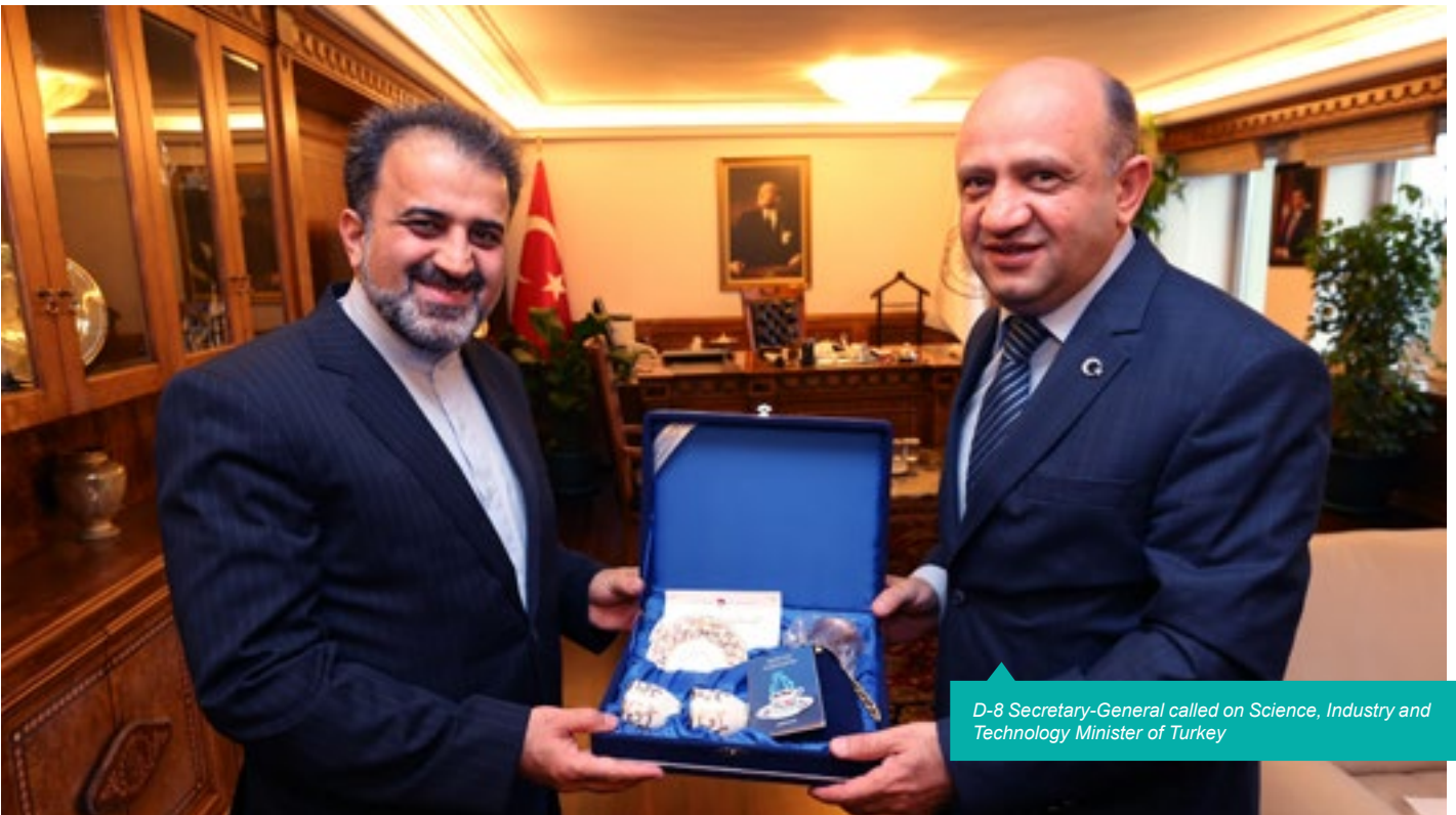
D-8 Secretary-General called on Science, Industry and Technology Minister of Turkey

D -8 Secretary-General, Seyed Ali Mohammad Mousavi paid a visit to Mr. Fikri Işık, Minister of Science, Industry and Technology of Turkey on 31 October 2014 in Ankara.