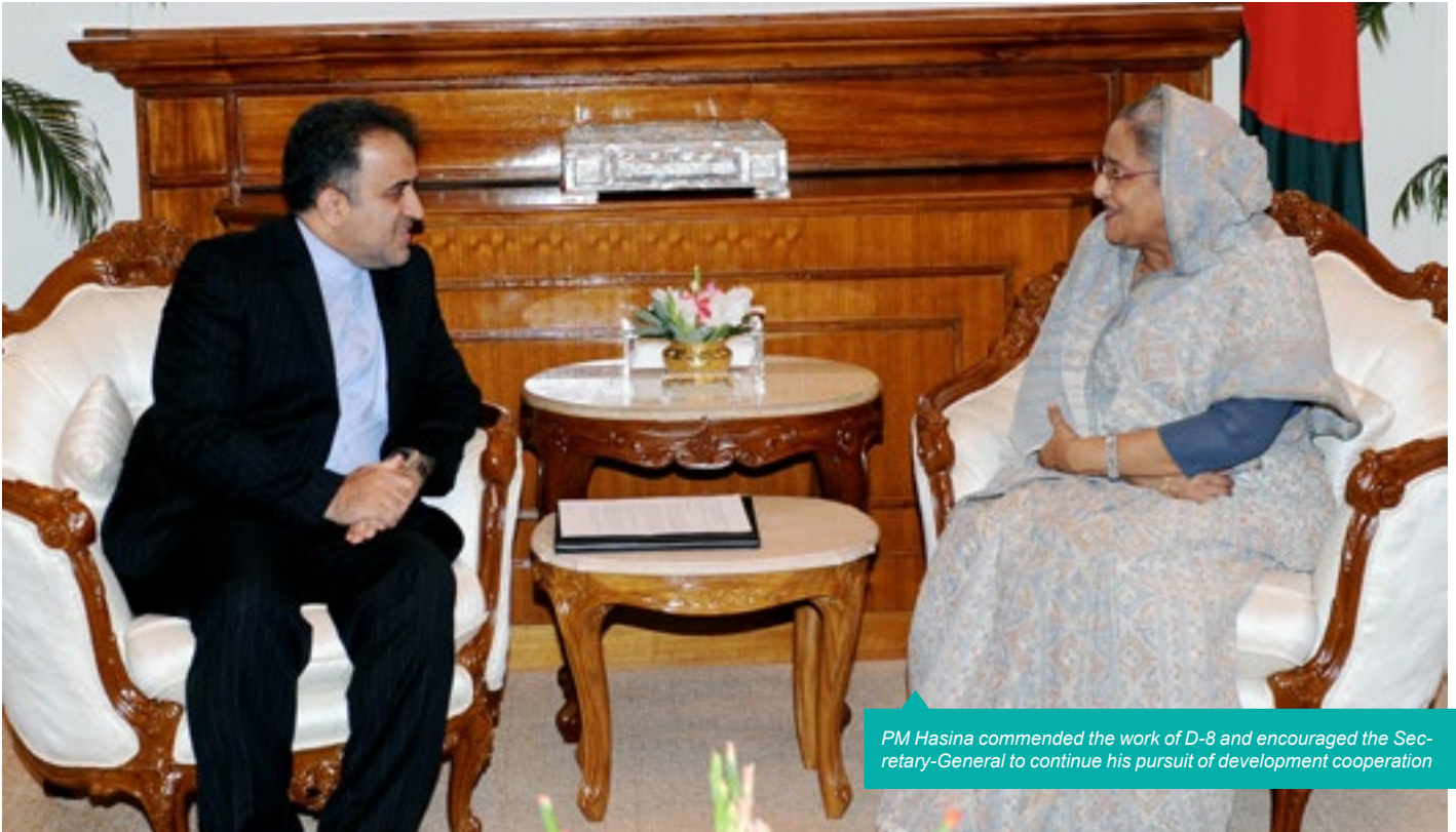
PM Hasina commended the work of D-8 and encouraged the Secretary-General to continue his pursuit of development cooperation