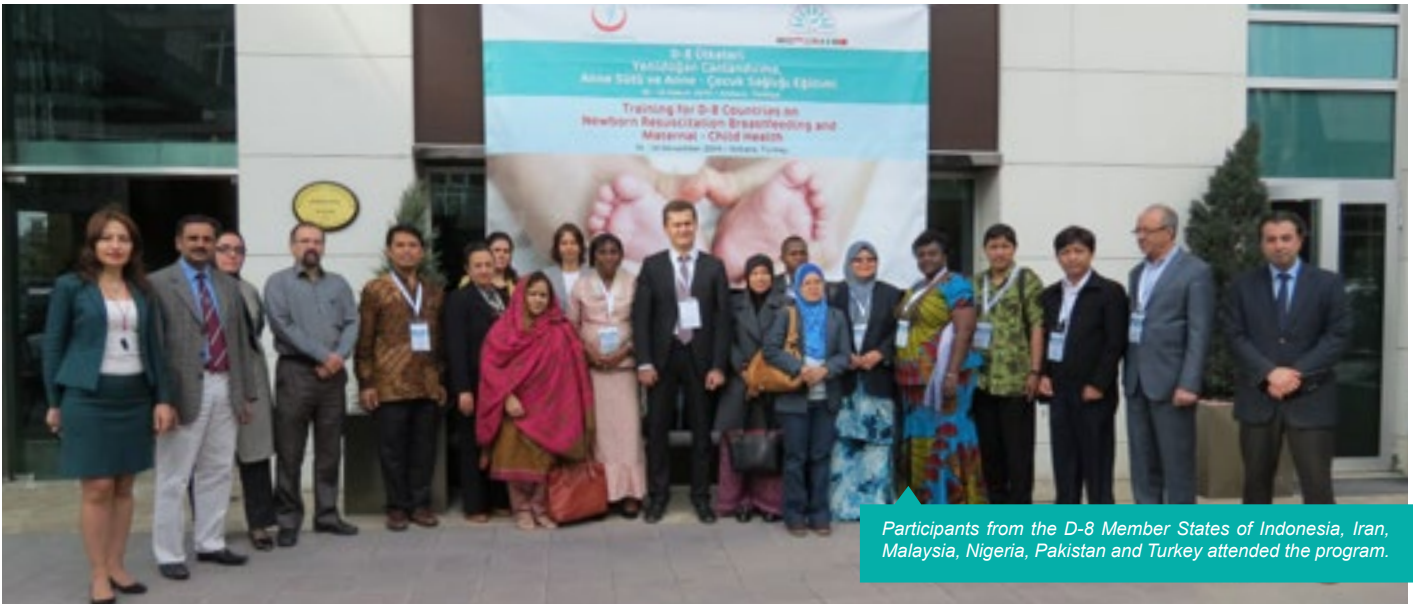
Participants from the D-8 Member States of Indonesia, Iran, Malaysia, Nigeria, Pakistan and Turkey attended the program.