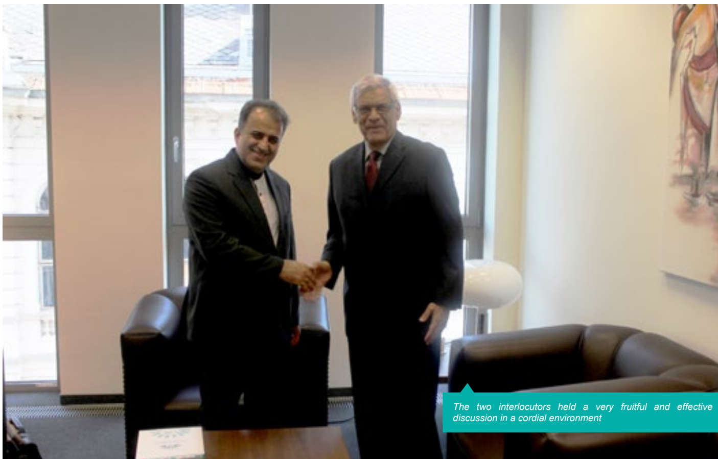
The two interlocutors held a very fruitful and effective discussion in a cordial environment