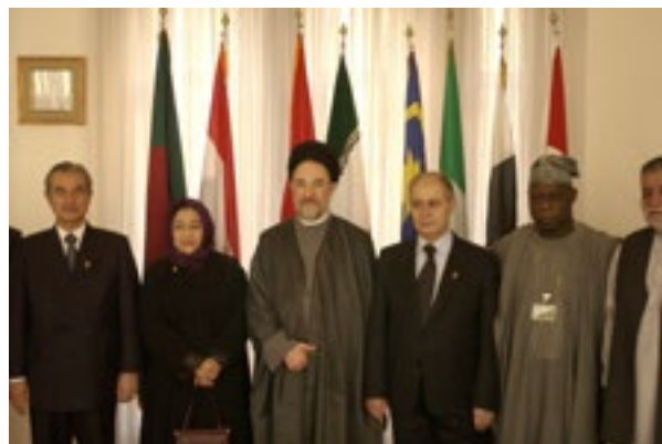
Fourth Summit (18 February 2004, Tehran, Iran)