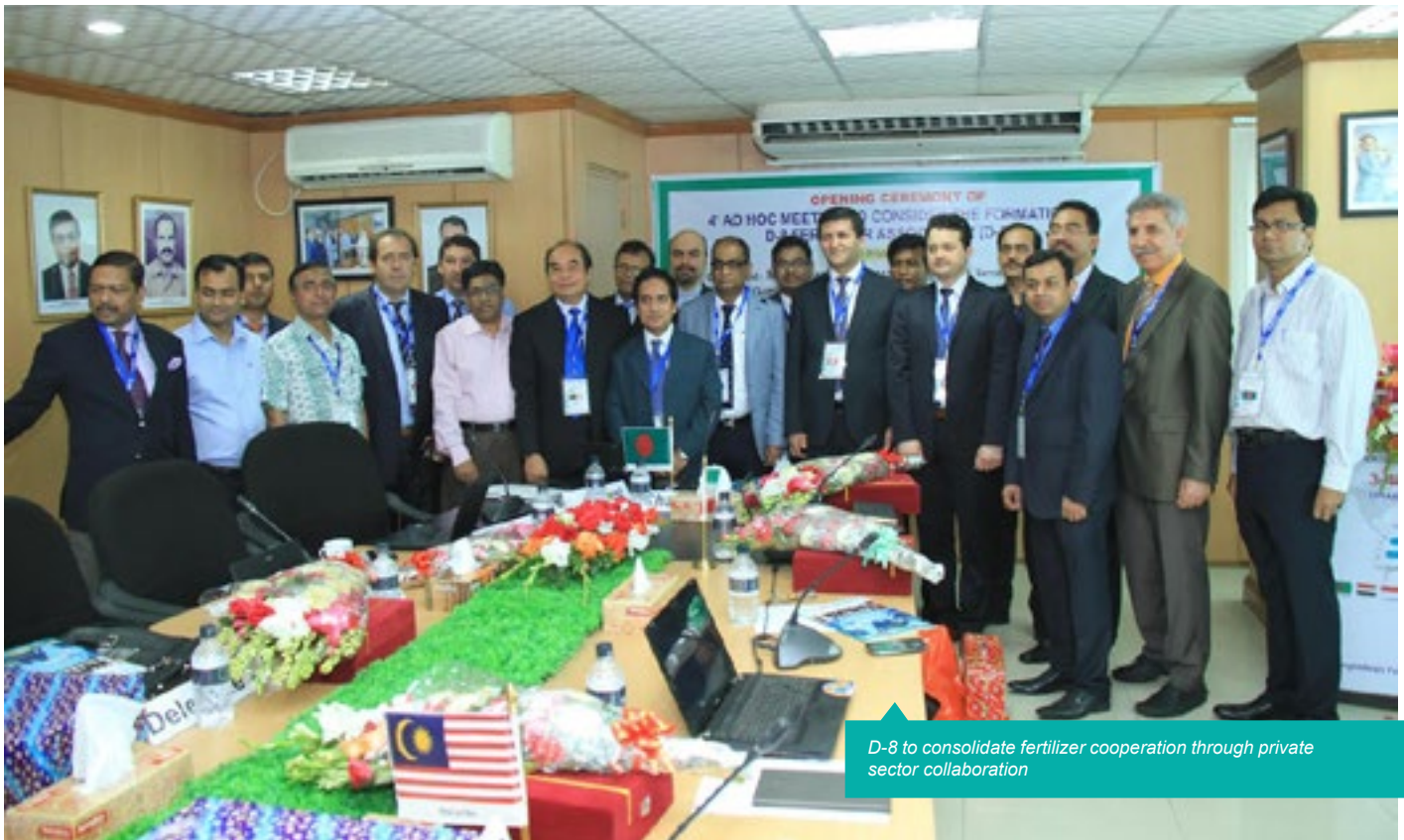
D-8 to consolidate fertilizer cooperation through private sector collaboration

4 th Ad Hoc Meeting to Consider the Formation of D-8 Fertilizer Association (D8FA) was held in Dhaka on 03-04 April 2015. Delegates from Bangladesh, Iran, Malaysia and Turkey attended the 2-day meeting.