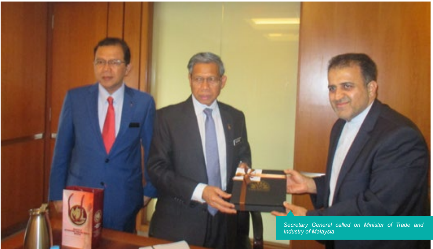
Secretary General called on Minister of Trade and Industry of Malaysia

D r. Seyed Ali Mohammad Mousavi, D-8 Secretary-General, called on Datuk Mustapha bin Mohamad, Hon. Minister of Trade and Industry of Malaysia (MITI) on 20 May 2015 at the MITI's office in Kuala Lumpur.