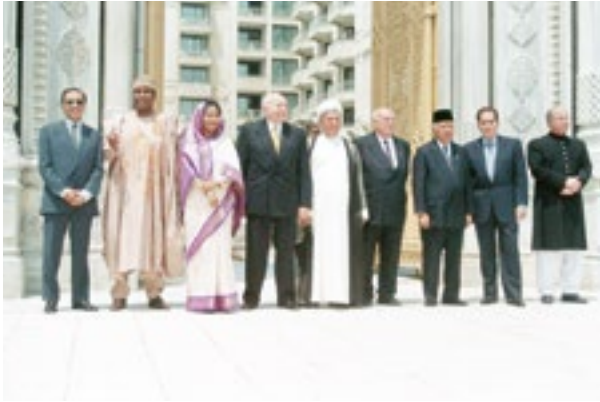
First Summit (15 June 1997, Istanbul Turkey)