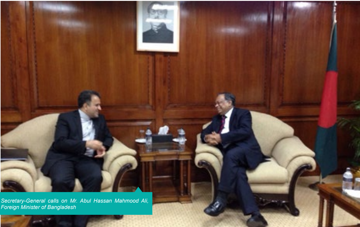
Secretary-General calls on Mr. Abul Hassan Mahmood Ali, Foreign Minister of Bangladesh