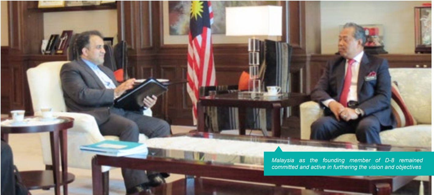
Malaysia as the founding member of D-8 remained committed and active in furthering the vision and objectives