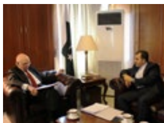
Pakistan as D-8 Chair to Focus on Increasing Intra-Trade