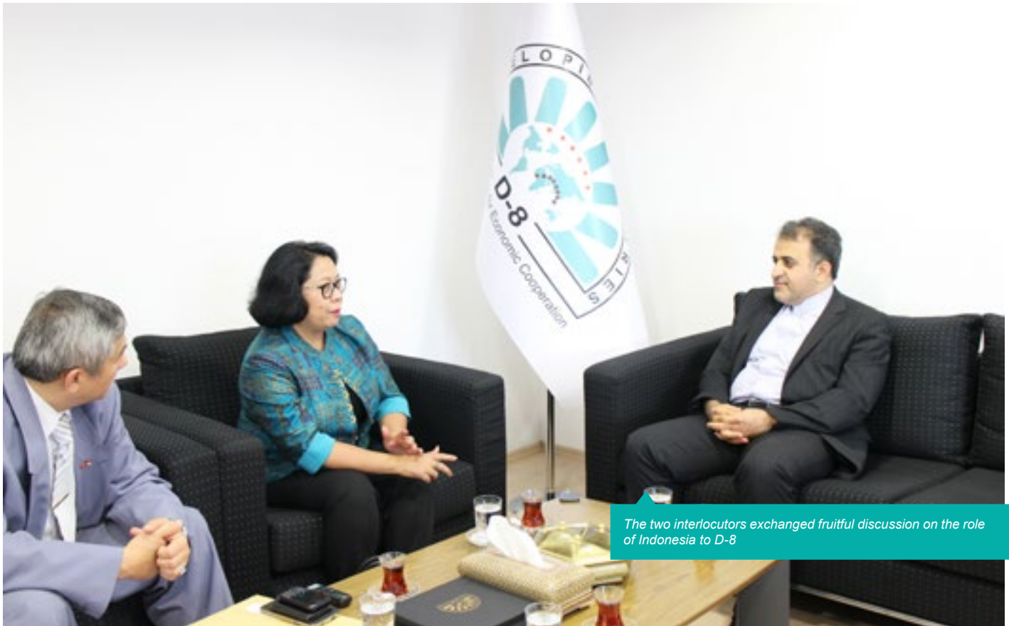
The two interlocutors exchanged fruitful discussion on the role of Indonesia to D-8