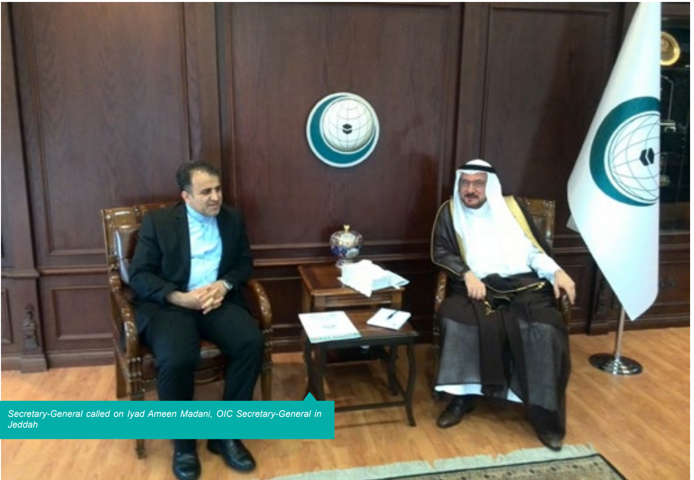
Secretary-General called on Iyad Ameen Madani, OIC Secretary-General in Jeddah