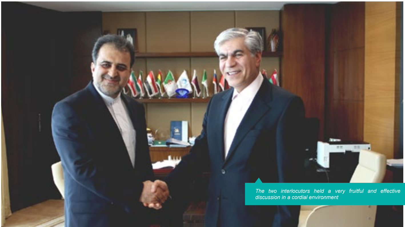
The two interlocutors held a very fruitful and effective discussion in a cordial environment