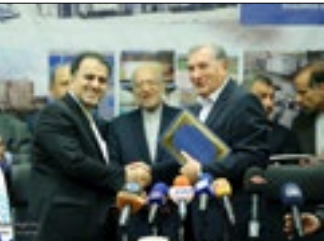
D-8 Industry Ministers met in Tehran