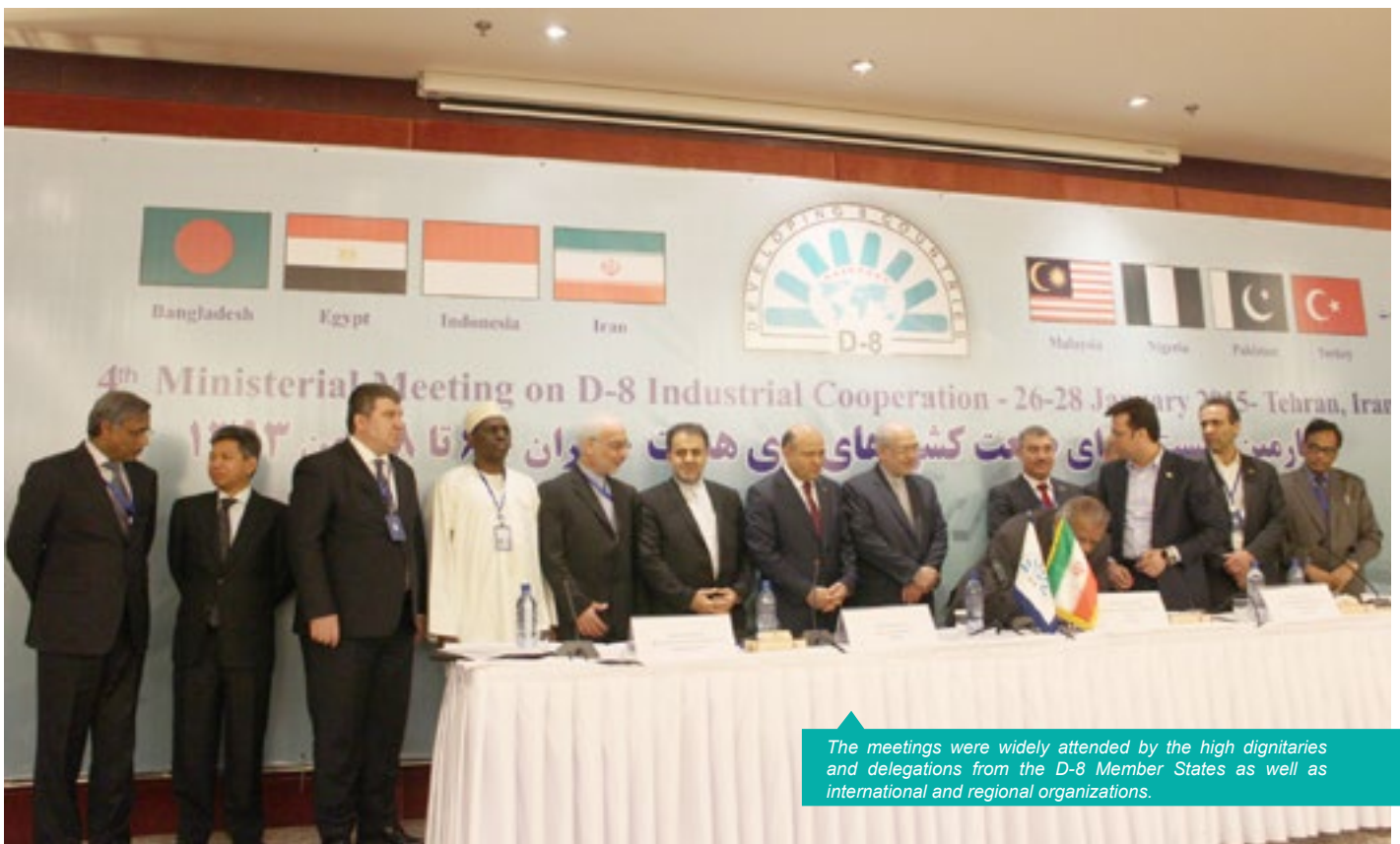
The meetings were widely attended by the high dignitaries and delegations from the D-8 Member States as well as international and regional organizations.

4 th D-8 Ministerial Meeting on Industry was successfully held on 28 January 2015 in Tehran, Iran with high-level participation from the Member Countries.