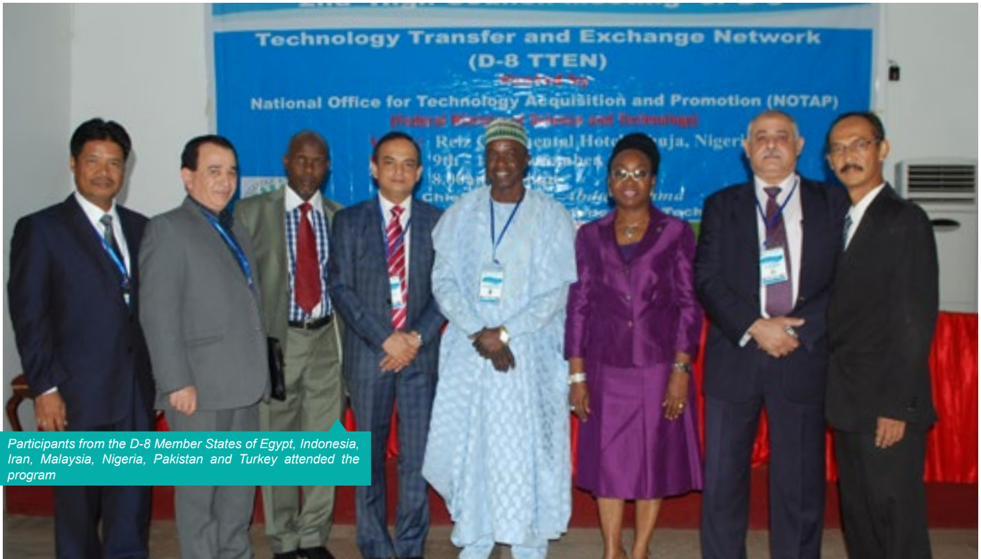
Participants from the D-8 Member States of Egypt, Indonesia, Iran, Malaysia, Nigeria, Pakistan and Turkey attended the program