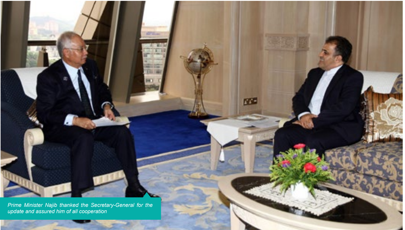
Prime Minister Najib thanked the Secretary-General for the update and assured him of all cooperation