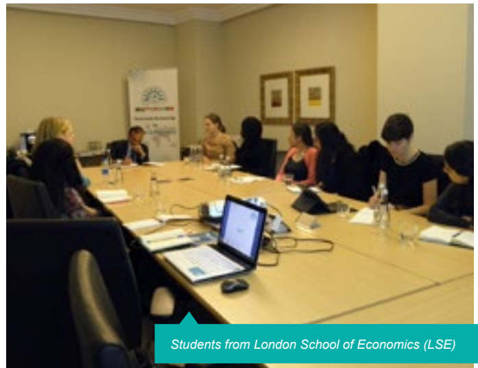
Students from London School of Economics (LSE)

‘The Developing Eight Organization for Economic Cooperation has been making steady progress in terms of concretising cooperation and partnership’— this was conveyed to the group of students from London School of Economics (LSE), Tilburg University, Parahyangan Catholic University in Indonesia and Club of Hohenheim e.V. visiting Turkey separately.