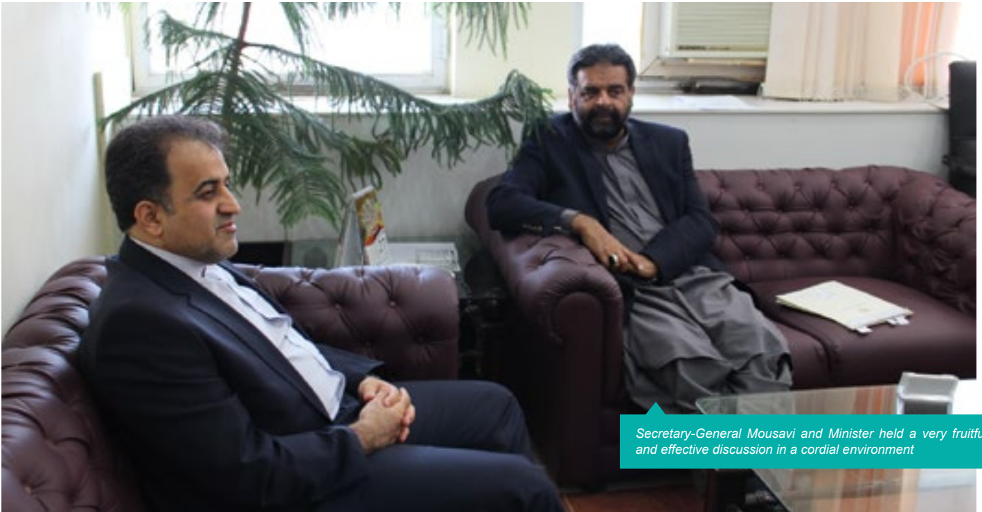
Secretary-General Mousavi and Minister held a very fruitful and effective discussion in a cordial environment