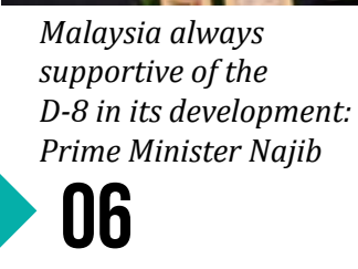
Malaysia always supportive of the D-8 in its development: Prime Minister Najib