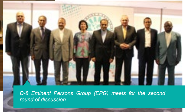
D-8 Eminent Persons Group (EPG) meets for the second round of discussion