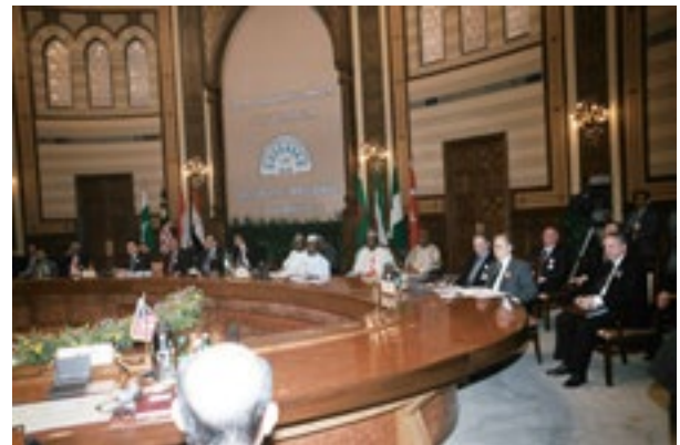
Third Summit (25 February 2001, Cairo Egypt)