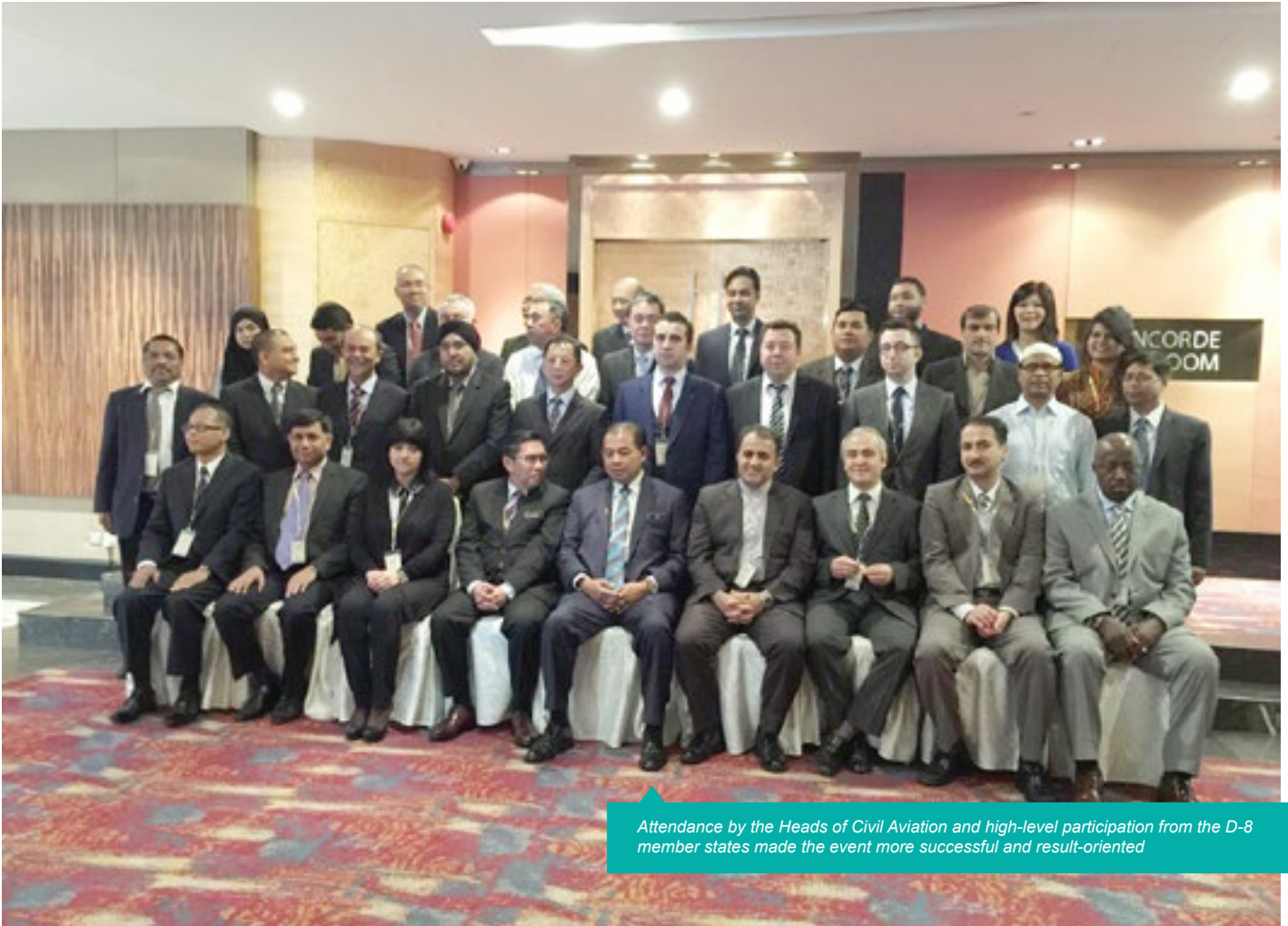
Attendance by the Heads of Civil Aviation and high-level participation from the D-8 member states made the event more successful and result-oriented