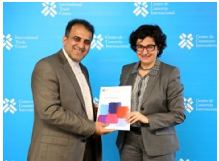
The two interlocutors agreed to work on development of collaborative partnership program in the area of trade

D r. Seyed Ali Mohammad Mousavi, Secretary-General of D-8, met Mr. Mukhisa Kituyi, the UNCTAD Secretary-General on 23 June 2015 at the UNCTAD Secretariat in Geneva.