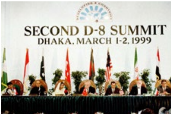
Second Summit (1-2 March 1999, Dhaka, Bangladesh)